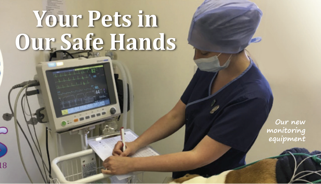
Our new monitoring equipment

Hello and welcome to our summer newsletter, and I hope so far you are enjoying the warmer temperatures after such a long winter!